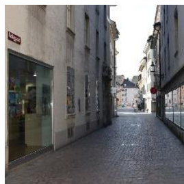
06 Lower spital