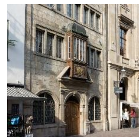
24 Club zur Geduld