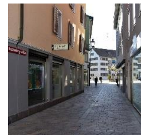
04 Crooked lane

The information is under the house number 39.