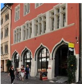
25 Weighing house

Marionette theater is the new name since 2017.