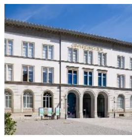
11 Museum of industry