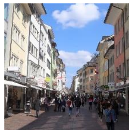
03 Lower gate

The information is under the house number 39.