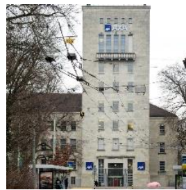
19 Axa Winterthur

Since 2014 one-third of the employees in Winterthur work in the Superblock at the Sulzerareal.