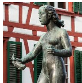
07 Fish maiden