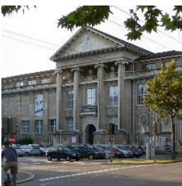
21 Art museum

The councillor lives since 2015 in the Superblock at the Sulzerareal.