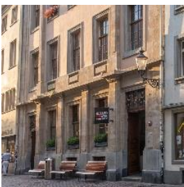
05 Old city hall