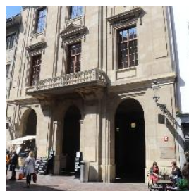
23 Town hall