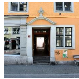
12 Music college