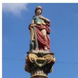
26 Justice fountain

Marionette theater is the new name since 2017.