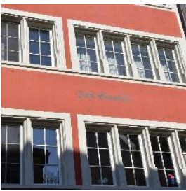
17 House names