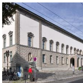
22 Art museum Oskar Reinhart