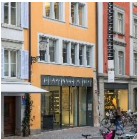
09 Town library