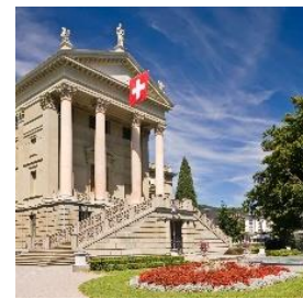
20 City hall

Since 2014 one-third of the employees in Winterthur work in the Superblock at the Sulzerareal.