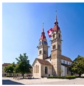
10 Town church