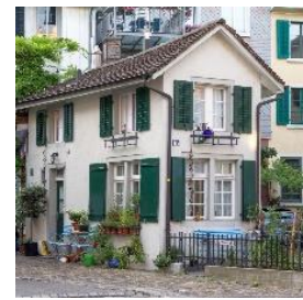
16 The smallest house